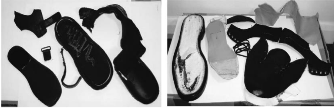
Fig. 2 Disassembly of shoes

concepts. Ecodesign improvements could reduce the amount of materials needed in shoes, thus reducing the amount of waste that needs to be handled at the end of the life cycle.